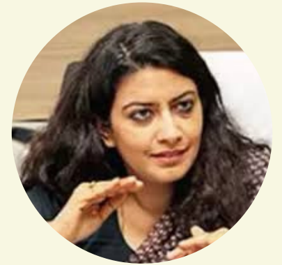
Arti Kanwar Resident Commissioner Gujarat