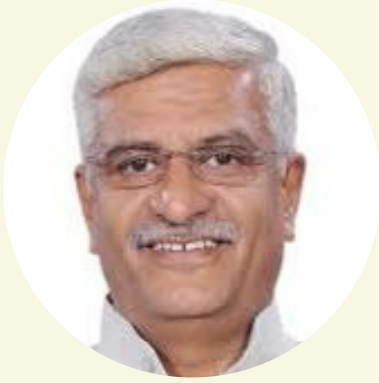
Gajendra S. Shekhawat Cabinet Minister, Jal Shakti