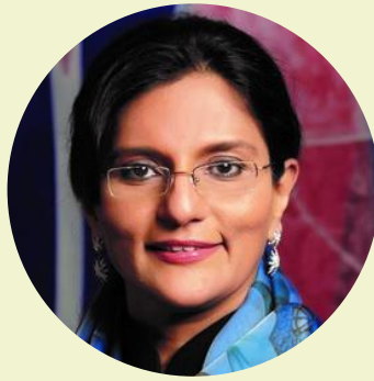
Preetha Reddy Vice Chairperson Apollo