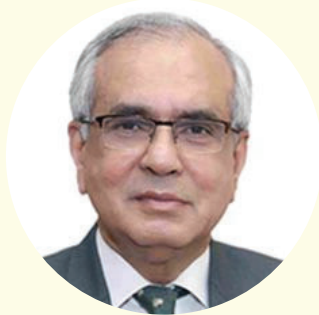
Shri. Hon. Dr. Rajiv Kumar

Chairman, Berkeley Innovation Forum Vice-Chairman, the NITI Aayog