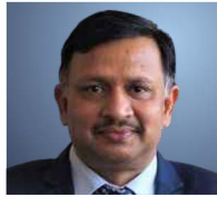
TV Nagendra Prasad Consul General of India San Francisco